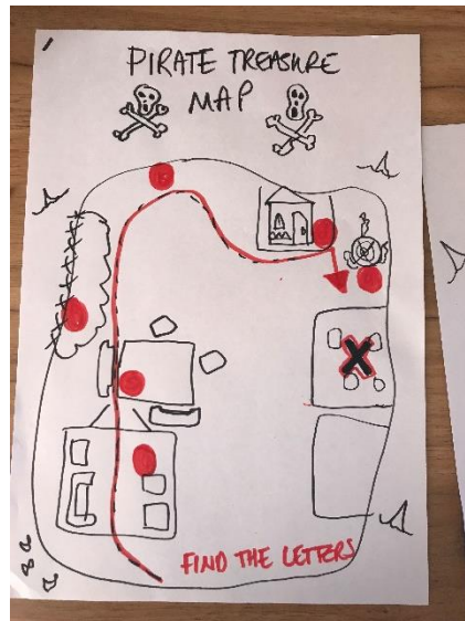
Example of home treasure map

Another way to understand how maps work is to hide an object or “treasure” around the house and make a map to find it! In the nursery, the children make treasure maps for the yellow room children, and the teachers make treasure maps for the Green Room, but if they have siblings, they can also make maps for each other! They love choosing little objects to put in a box and find them, and drawing the maps is very good for their spatial skills! We can also hide numbers or the letters of their name to add other areas of development to this activity!