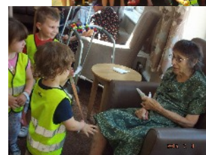
Children visit Burlington House Care Home (July 2015)