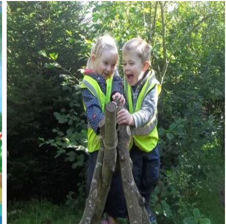
Climbing at Forest School- developing gross motor skills, self-confidence and self-esteem while having fun!

Using scissors and tools regularly, together with activities like using clay, tweezers, threading, sewing and constructing help develop skills, muscle strength and precision. This supports the development of fine motor skills and hand strength, which makes it easier for children to learn to write.