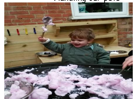
Fantastic foam play