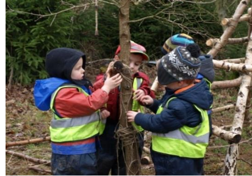
Exploring construction and tying knots

Children at Westwards use real tools in a safe, controlled way under the guidance of Forest School trained staff, to develop self-esteem, physical skills and communication skills