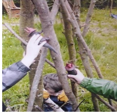
Investigating concepts in meaningful ways- whose dinosaur can get highest up the tree?