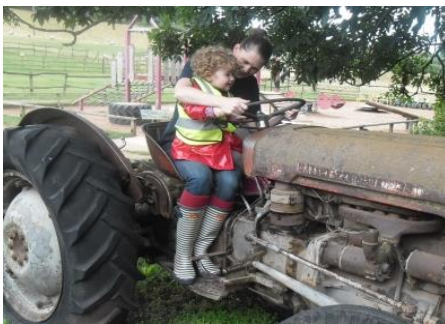
Riding a tractor at the farm!