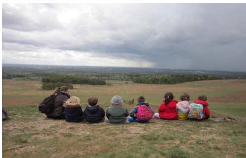
Communicating and working together to achieve tasks that cannot be done alone