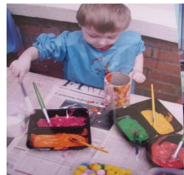
Decorating junk models