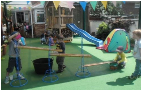
Investigating and experimenting with water flow down bamboo channels