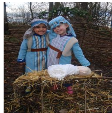
Our Woodland Nativity!

With a presence of 60 years we play an active role in the local community, putting on events for parents and using the local environment. Our range of events include visiting the local Care Home to perform the Christmas Nativity, Easter Event and a Woodland Nativity!