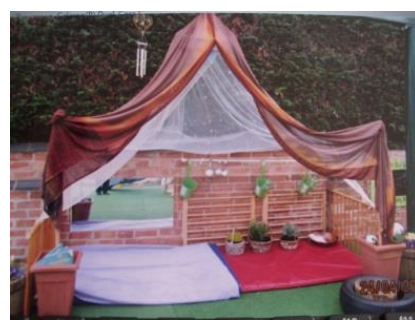
A 'communication friendly space' in the outdoor area