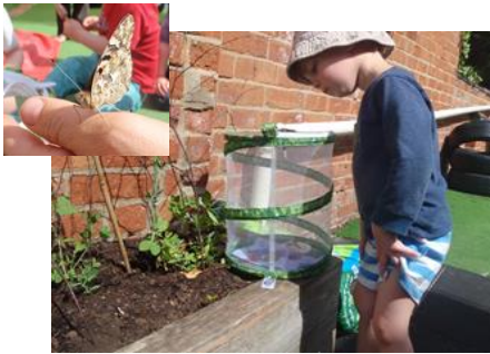
Observing our butterflies before they were released

The indoor environment at Westwards is tailored to suit each age group. Our well resourced classrooms are carefully designed to suit the group of children we have at the time, ensuring individual needs are catered for. The rooms are spacious with attractive, homely furnishings and high quality resources. We have a room specifically for physical play. We make good use of natural, recycled and open ended materials, which are beneficial for child development.