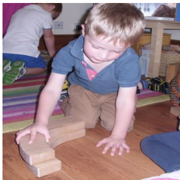
Wooden block construction