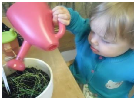
Growing and caring for plants