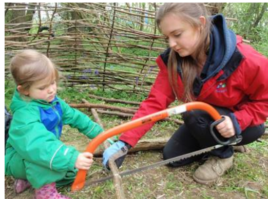
Using a bowsaw to cut hazel rods for den building

Children at Westwards use real tools in a safe, controlled way under the guidance of Forest School trained staff, to develop self-esteem, physical skills and communication skills