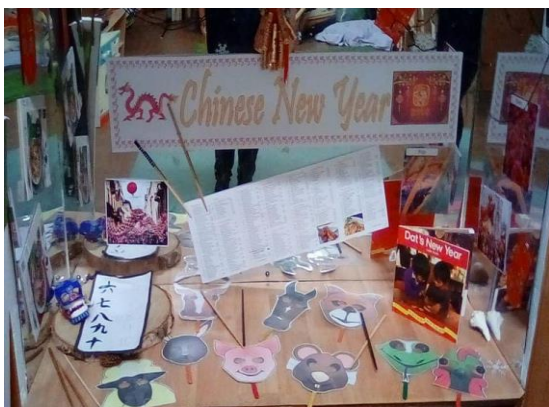
Learning about different cultures in interesting ways

We support children as they develop confidence, self-respect and a positive attitude towards learning. They are encouraged to work and concentrate independently and also to take part in group activities, sharing and co-operating with other children and adults. Through these activities, conversation and practical example, children learn acceptable ways to express their own feelings, understand the difference between right and wrong and have respect for the feelings, views, beliefs and cultures of others. We help children to prepare for school by encouraging independence in dressing, toileting and at mealtimes, pouring their own drinks and serving their own food.