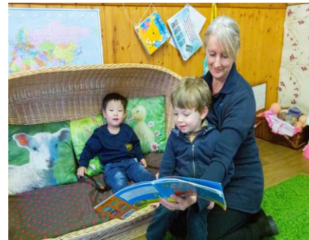
Cosy reading den for calm story times

We offer an inspiring, well thought out environment to encourage children to explore the space and interact with people and materials.