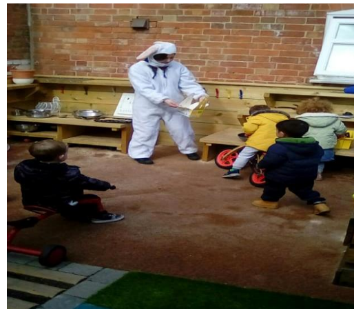
Easter bunny visit for the easter egg hunt - fun in the bespoke mud kitchen