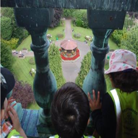
Using physical skills on regular trips out- climbing the Carillon Tower in Queen's Park.

Children at Westwards have plenty of space and a wide selection of resources including 'soft play', bats and balls, bikes and balancing and climbing equipment. Close adult supervision enables children to safely negotiate physical challenges, developing and increasing skill and control in moving, climbing and balancing. Many physical challenges at Forest School mean that children develop strength and confidence. We have access to an covered outdoor area with an all weather surface, so physical activity is not affected by the weather. We even have a new physical play room with a beautiful woodland mural!