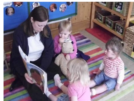
Enjoying stories in small groups or one-to-one