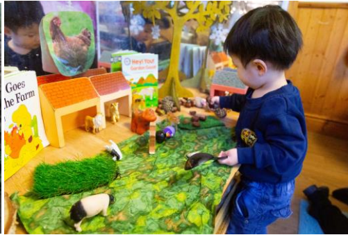
Investigation area in the Rainbow room