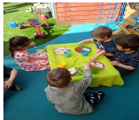
Developing interpersonal and social skills during an outdoor lunch