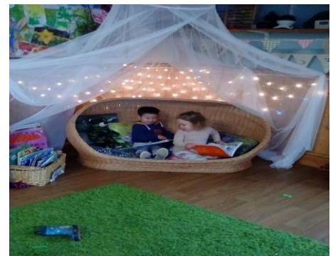
Quiet relaxing area

Children choose from a wide variety of activities including construction, role play, books, singing and 'Beat Babies', dancing, music, water, sand, dough, paint and clay, digging, ride on toys, climbing and den making. Our high quality resources also include selections of natural materials, carefully chosen to engage and inspire children. Block play is a particular favourite of this age group, so we offer high quality resources to develop this interest.