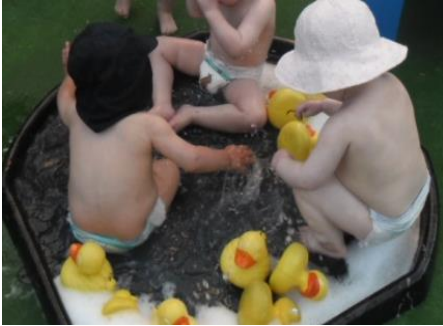
Using everyday opportunities for maths- counting ducks in the water

Our knowledgeable staff support children as they develop understanding of mathematical concepts. We offer a wide variety of activities and opportunities, both indoors and out, for children to explore and practice their skills. The concepts of matching, ordering, sorting and an understanding of comparative language such as 'bigger' and 'more than' are introduced in practical, meaningful contexts and through games. We use songs, rhymes and games to help reinforce important concepts like addition and subtraction. We offer many opportunities to learn about and use patterns and shapes. Problem solving approaches are promoted by staff while children are playing, model making or using construction materials: 'How can we make that fit?' 'I wonder what will happen if we do that?' 'Shall we try it?'