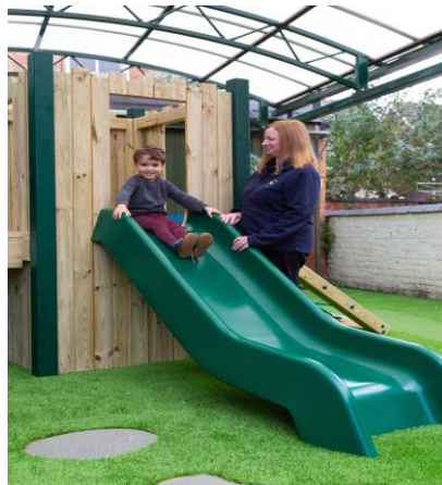
Whizzing down the slide on our play tower