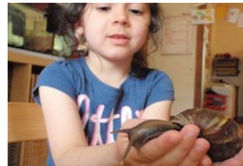
Handling our pets

We go on walks around the local area and on trips further afield in a mini-bus. Our Forest School trips are invaluable for supporting children's knowledge of the natural world. Computers, cameras and programmable toys are available to the children along with a wide range of resources for experimenting with, to explore concepts like light and dark, temperature, magnetism and gravity.