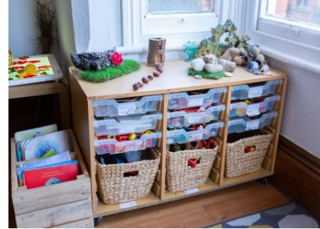
Using inspiring, tactile natural resources for counting and sorting