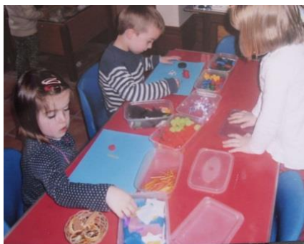
Our art areas have a wide range of accessible resources to encourage independence and creativity