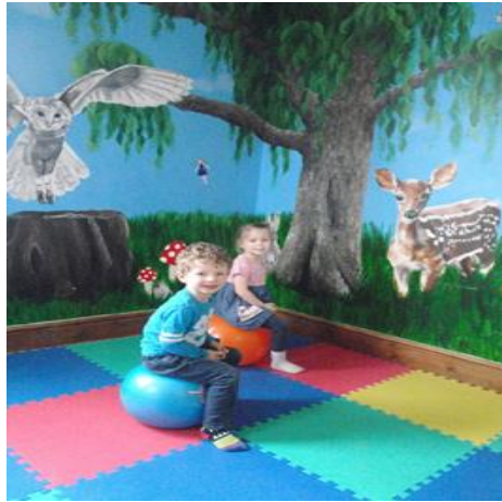
Using spacehoppers in our physical play room