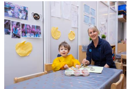
Painting activity in our bright conservatory