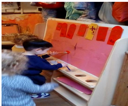
Choosing to mark make with friends

Children are given lots of time to listen and respond to stories, songs and rhymes, to talk about their experiences and to make up their own stories. They experiment with sounds and rhythms and learn to link letters with sounds. Well stocked, freely accessible book corners give every child the opportunity to become familiar with books, to handle them and be aware of their uses, for reference and as a source of stories and pictures. We start with large scale mark making to develop children's interest and muscle strength, to support the development of good early writing skills when each individual is ready. A mark making table with a range of crayons, pens and chalks, envelopes, diaries etc. encourages the development of handwriting skills. Role play areas are equipped with pencils and clip boards so that writing can be used in 'real' situations.