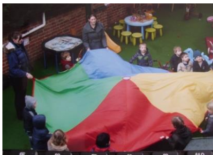
Learning about effective communication in fun ways-following instructions during parachute games

Our staff are skilled at communicating with children and at supporting children to communicate effectively with staff and with their peers. We model positive language and a wide range of vocabulary. We make plenty of time to talk in a variety of social situations, including one to one conversations, chatting at lunch and tea, taking turns in group discussions and speaking in front of a small group, emphasising the value of listening skills. The learning environment is planned as a 'communication friendly space' with little areas and dens for children to go to and talk with friends.