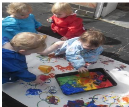
Large scale painting outdoors

Westwards provides a wide range of materials and resources to allow children to make creative choices and express themselves individually. Art equipment, including paint, glue, crayons, natural materials and various inspiring artefacts afford many opportunities for the exploration of colour, shape and texture. Throughout the day there are opportunities to use imagination in art, construction, role play and music. Children have plenty of chance for creativity at Forest School, using all the natural and open ended materials!