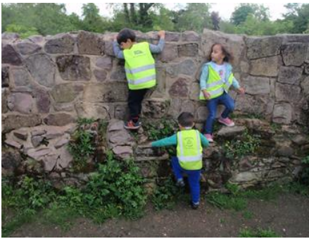
Plenty of trips out- developing physical skills and confidence

In our last Ofsted inspection we were awarded 'Good' and in our last quality review by Leicestershire County Council we achieved a quality grade 1, the highest grade possible, with comments that we have an 'outstanding learning environment' where 'considerable effort and expertise have been employed to create attractive learning spaces.