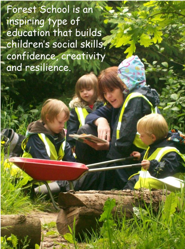
Enjoying and exploring the woodland- happy children in a natural environment

Forest School is an inspiring type of education that builds children's social skills, confidence, creativity and resilience.