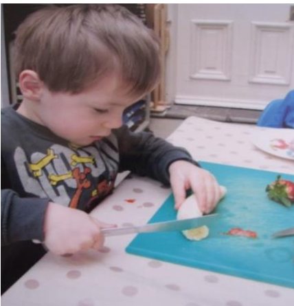
Using a knife to chop banana and strawberries for snack time

Using scissors and tools regularly, together with activities like using clay, tweezers, threading, sewing and constructing help develop skills, muscle strength and precision. This supports the development of fine motor skills and hand strength, which makes it easier for children to learn to write.