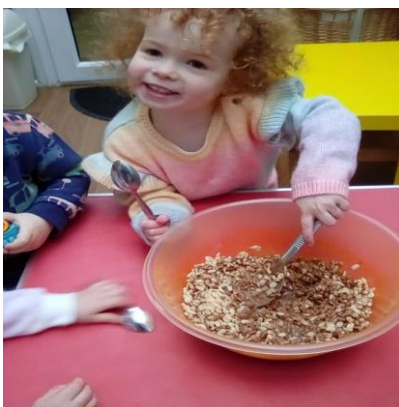
Enjoying cooking Easter treats - teaches turn taking and sharing in a fun way