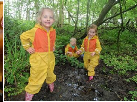
Exciting outdoor experiences in all seasons and all weather!

Our staff team is highly qualified, caring and experienced, providing children with a nurturing environment. We believe that interaction and communication between staff and children as well as between children is vital, and offer a physical and social environment which is rich in opportunities for communication. Our team have the skills and training to ensure a nursery environment that nurtures each child and offers lots of opportunities to acquire the necessary skills for a smooth and happy transition to school. Most importantly, we make sure everyone has fun!